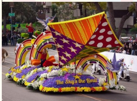
Photo By: Ramona Monteros First Printed at examiner.com on April 4, 2013 with an article by Laura Monteros

Effective July 1, 2013, new government regulations will prohibit our employees from discussing policy terms and coverages with residents of states outside of the state where our company is registered. As you are aware, our corporate office is located in New Hampshire and our licensed insurance agents are still happy to provide insurance quotes to all, but may only discuss policy coverages and conditions with residents of New Hampshire. In order to alleviate any difficulties and still allow all our members the ability to purchase vacation protection, our preferred insurance company, Travel Guard will be available at a toll-free number and via our website to answer policy questions concerning coverages and terms. Ask about travel protection for your next CRIVacation.